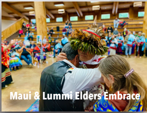
Maui & Lummi Elders Embrace

Esqalph etse Kwelengsen will host a traditional potlatch with a full-day of food, testimony, songs, dances, cultural exchanges and ceremony with our honorees, sponsors and canoe families. ❖