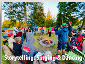
Storytelling, Singing & Dancing