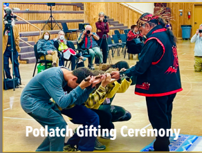
Potlatch Gifting Ceremony