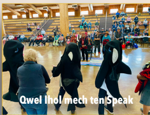
Qwel Ihol mech ten Speak