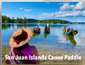
San Juan Islands Canoe Paddle

The Gathering of the Eagles begins with a mini-canoe journey starting in Anacortes, WA; traveling to Lopez Island, San Juan Island & Orcas Island; with canoes arriving at Lummi Nation on Friday, May 26th. Our Esqalph (gathering) Committee will provide logistical, camping and transportation support for confirmed canoe families: Carvers Camp, Chief Leschi Schools and the Hawaiian Voyaging Canoe Society. Our mini-paddle will follow canoe journey rules with safety boat escorts and emergency protocols ensuring a safe and pleasant journey. ❖