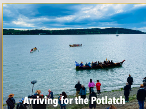
Arriving for the Potlatch